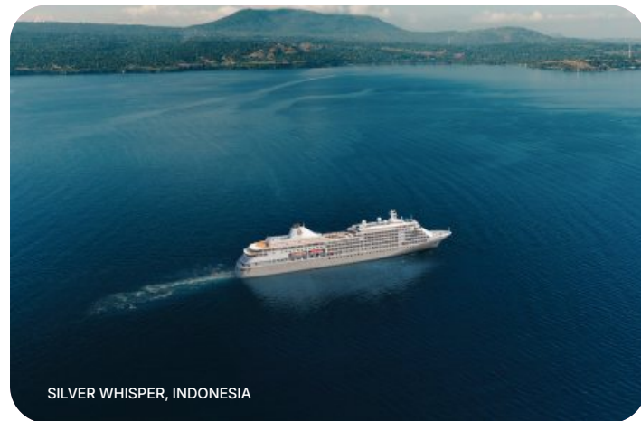
SILVER WHISPER, INDONESIA

1 Only with the All-Inclusive Plus Fare. | 2 At the airport of arrival. | 3 For World Cruise 2029 bookings, medical services including consultations with the ship's medical team, initial visits and check-ups for chronic conditions as well as lab tests, dressings, and medications not to exceed a total cost of $1,000 USD are included for all passengers. Passengers are responsible for all lab tests, dressings, and medications more than $1,000 USD as well as prescription medications, refills, and additional tests that may require arrangements at the next available port. | All other standard inclusions apply.