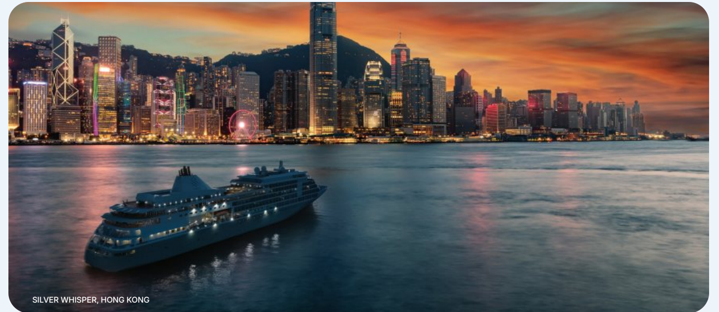
SILVER WHISPER, HONG KONG