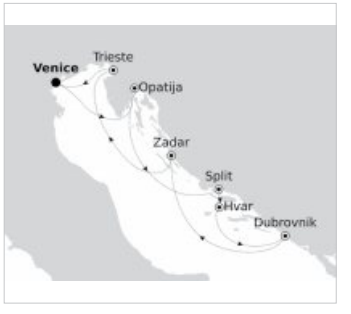
COUNTRIES: Italy, Croatia