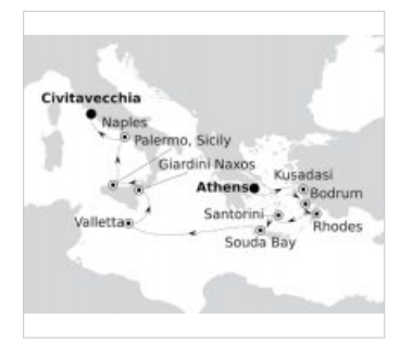
COUNTRIES: Greece, Turkey, Malta, Italy