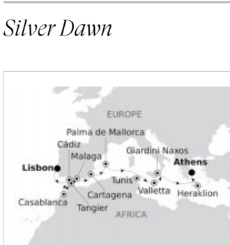
COUNTRIES: Portugal, Spain, Morocco, Tunisia, Malta, Italy, Greece

PORT-TO-PORT ALL-INCLUSIVE FARE FROM € 8.600 € 6.8800