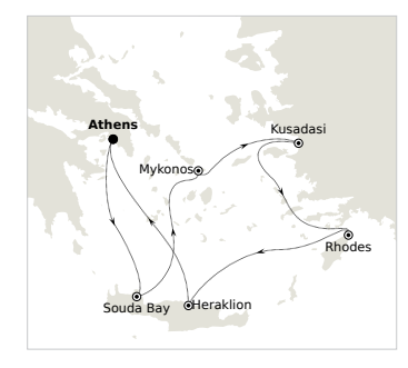
COUNTRIES: Greece, Turkey