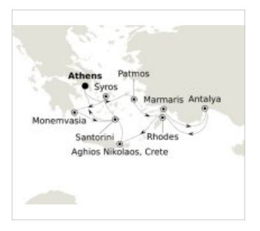
COUNTRIES: Greece, Turkey