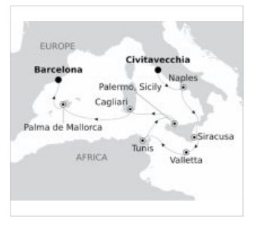
COUNTRIES: Italy, Malta, Tunisia, Spain