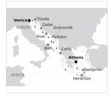
COUNTRIES: Italy, Croatia, Montenegro, Greece