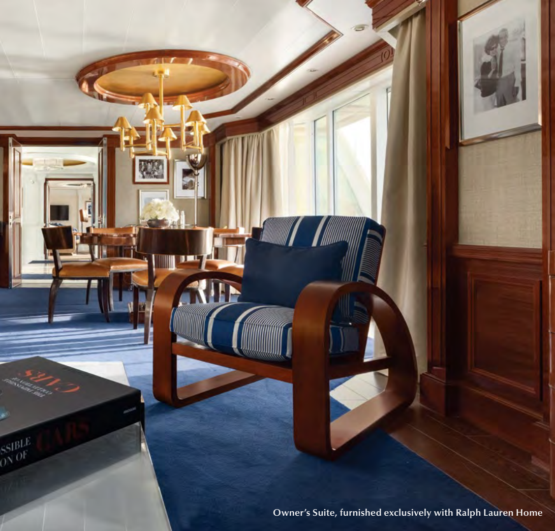
Owner's Suite, furnished exclusively with Ralph Lauren Home