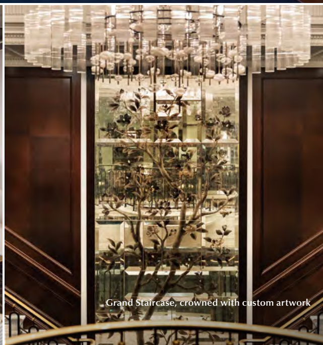
Grand Staircase, crowned with custom artwork